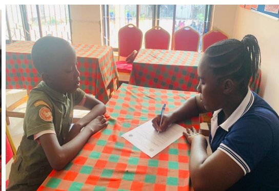
Interviews with victims rescued from acts of female genital mutilation