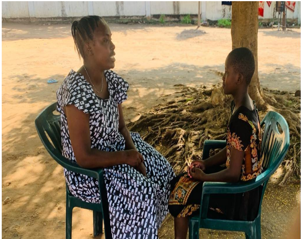
Individual Counselling session at Butiama Safe House