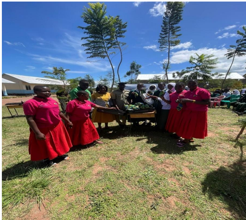
Girls and Police gender Desk taking a picture during distributing pads for girls

booth we collaborated with Police to provide GBV education to the for participants who arrived at our display booth during the exhibition. During the exhibition we managed to conduct GBV education session to the students and share their views about the position of Girls based on the topic with a them that says “every life matter, end femicide and violence against women and children” toward on the Girl child day which was heard at Mapinduzi Secondary school. during the 16 days of activism, we were able to successfully provide education to 350 students who came to the exhibition and were given education against acts of violence, sexual violence, psychological violence and other violence that are harmful to girls. Also, we provide support to the 100 girls who were given sanitary pads to help them protect themselves during the challenges of the menstruation period. which will save them and continue their studies without encountering any challenges while they are in the menstruation period without losing study periods.