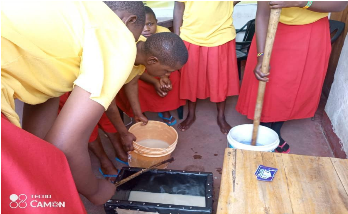
During the soap-making training practical session