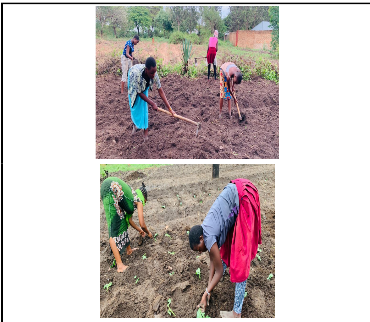
Girls preparing the land but also planting Sukuma wiki at Butiama Safe House