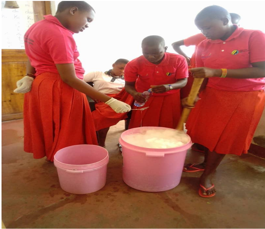
Girls are Making of the water soap

students have understood well how to make soap, three students still don't know it well. mahiji 20 liters, sless, sulphonic acid, sless needle, greyline, paint, CDE, CMC, perfume and salt.