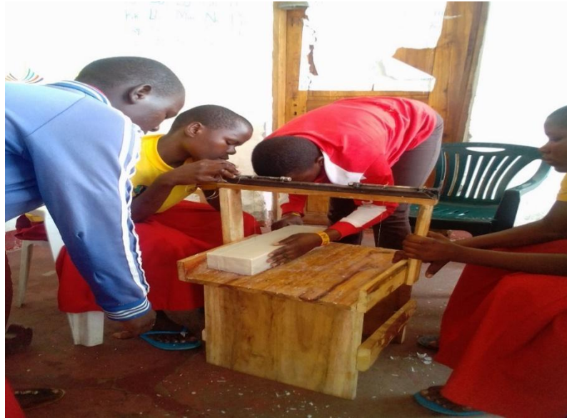
During the soap making training practical session

2. Culture Making: During this period the girls at Mugumu the continued on making hands-on Culture in practice and knowing numbers the students of Jajasilamal continued with the production of hand culture until now we have made 52 cultures. We have managed to sell 23 cultures, there are 29 cultures remain, the activity is still going on. In the production of bracelets kachas, all 13 students have understood how to make hand culture very well, no one has not understood. We have also used the following raw materials;