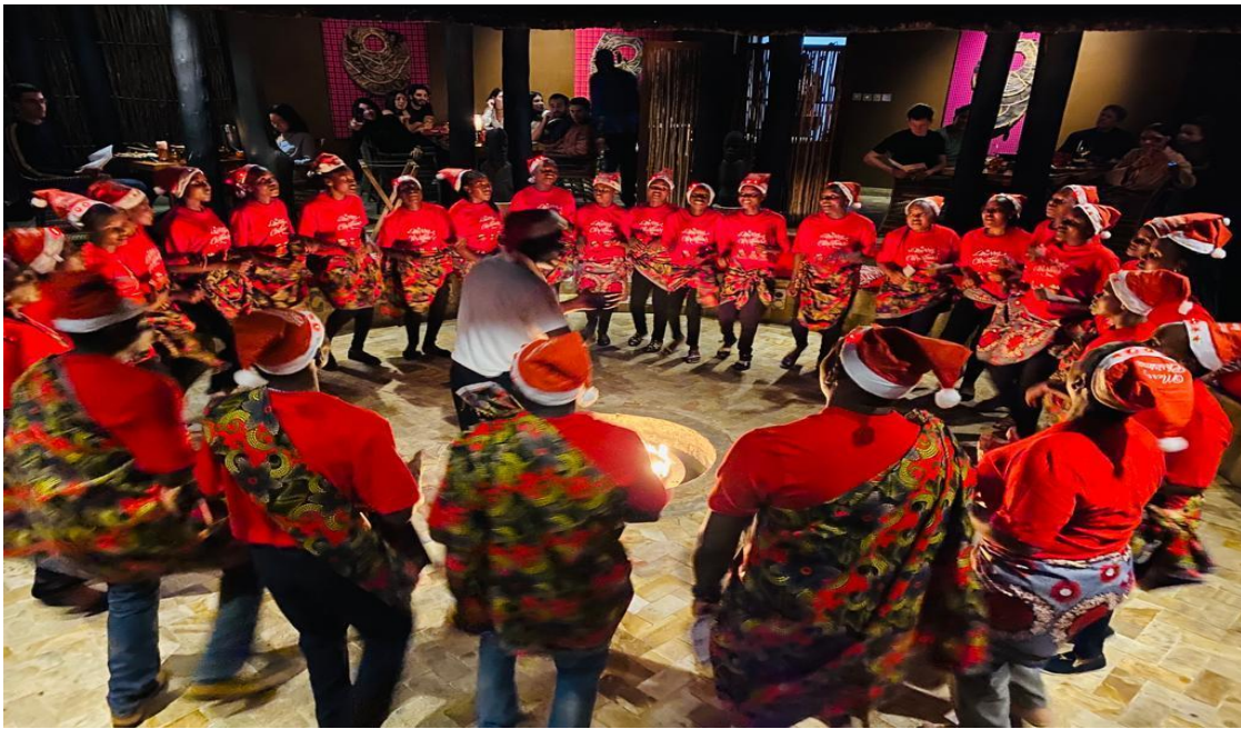
Girls and Staff of FourSeasons Hotel are singing Christmas song at Fourseason.