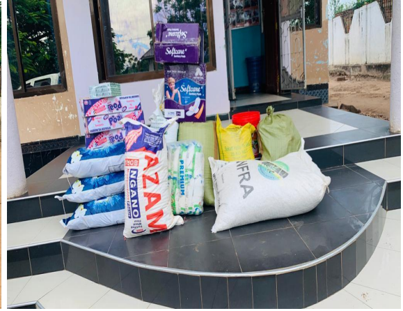
Photos showing the visitors from Butiama district who brought Christmas gifts