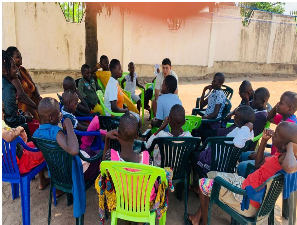
Group Counselling Session at Butiama Safe House