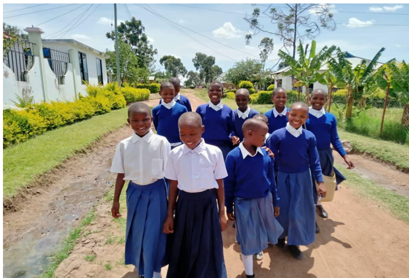
The primary school girls enjoying going back to school