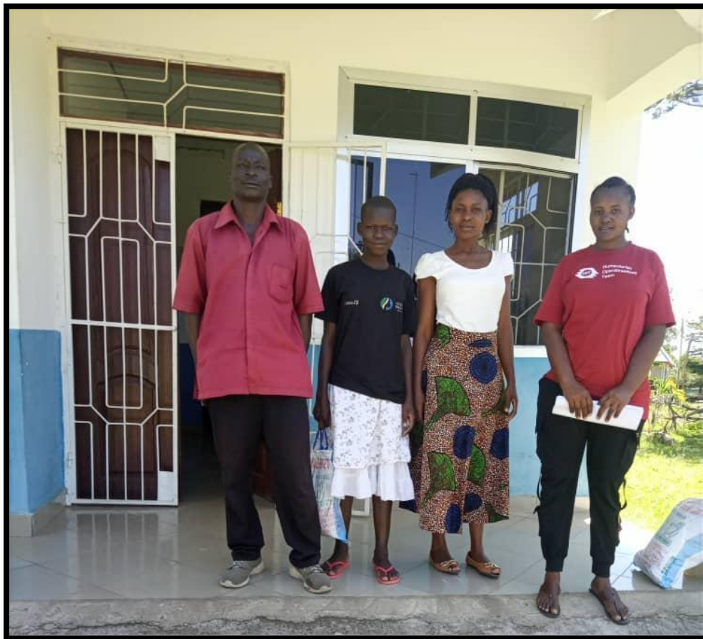
During the Reconciliation Meeting Session