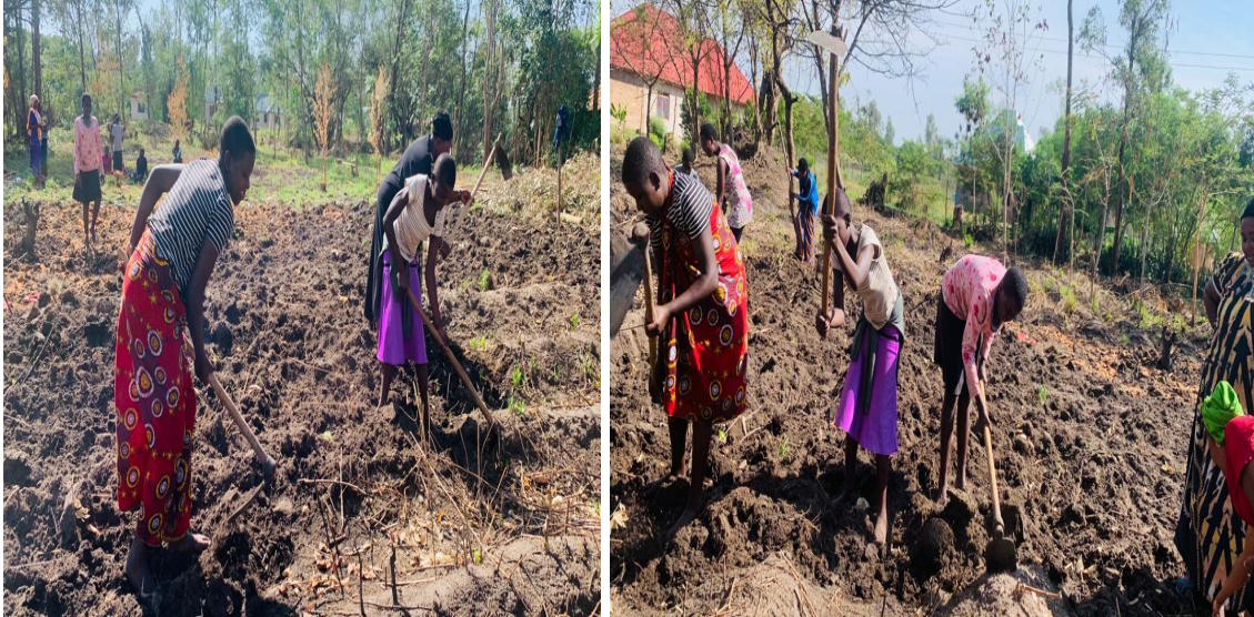
Photos showing girls at the garden