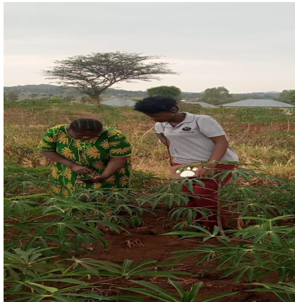
Photos showing the agricultural officer at some of the farmers' farms.