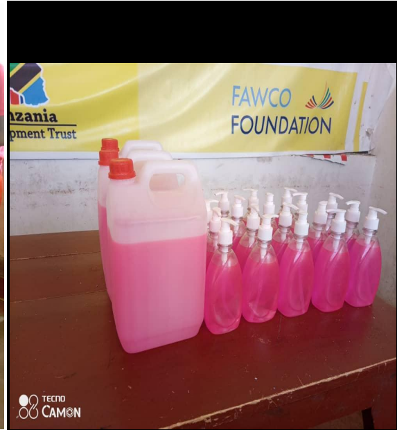
Girls are Making liquid soap