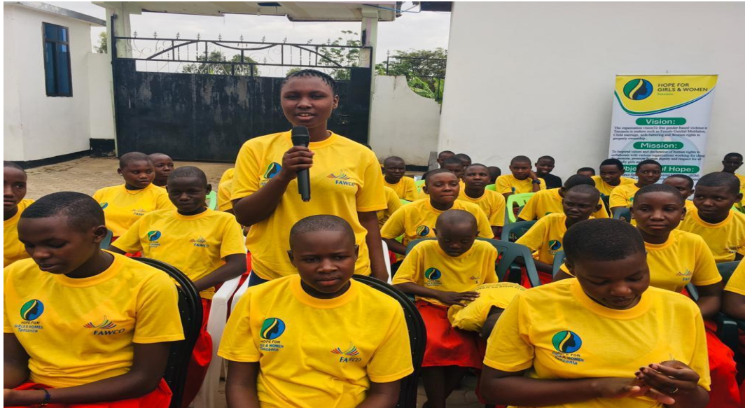
One of the girl got opportunity to share her view in debate session.

Throw this session 100 people managed to visit our account and see our girls using this platform to advocate the issue globally.