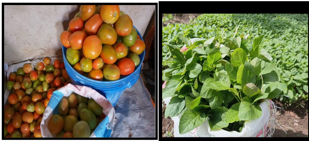
Our garden at Mugumu