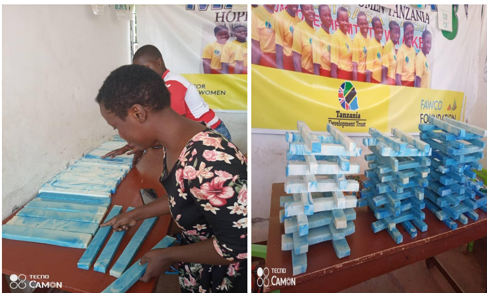
During the soap making training practical session