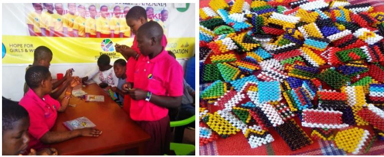
Culture making class