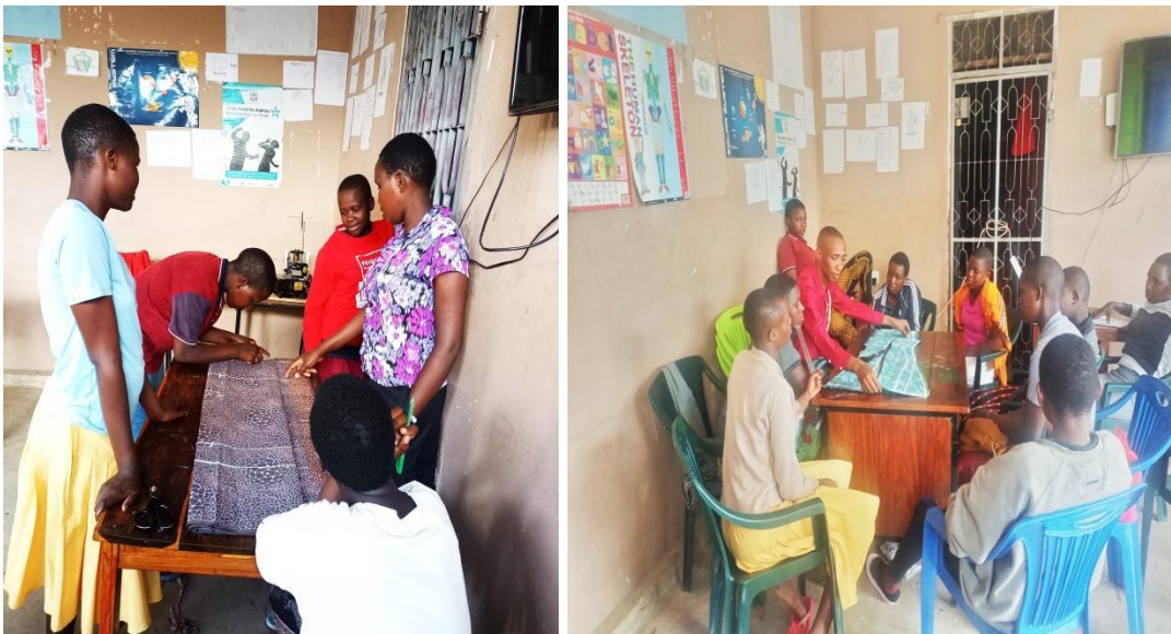
Photos showing some of the vocational girls measuring cloth and cutting different types of clothes taught and ready for sewing.