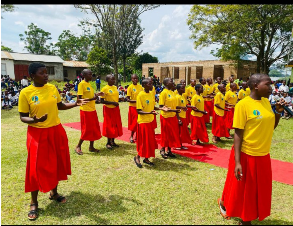
Photo taken during the African child day girls presenting a special song.