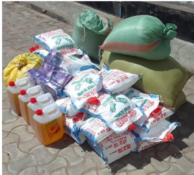
Support of food we receive from Four seasons

Mugumu safe house received valuable support from Fourseasons, Thank you very much for food support. HGWT management team is thanking Fourseasons for their support of a knitting machine to Mugumu Safe house to support sweaters production to enable income generating.