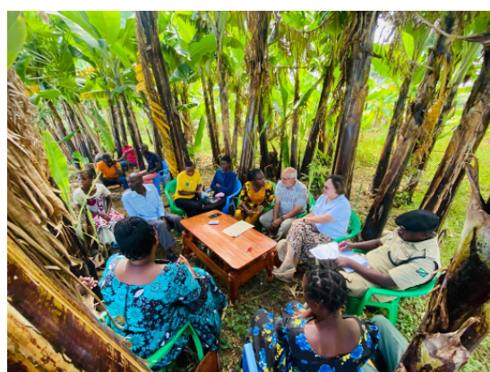
Photo showing a fit family visit together with social welfare in Butiama and reconciliation team