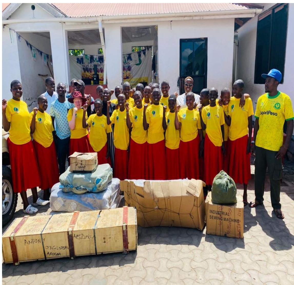
Photo showing a Knitting machine supported to Mugumu Safe house by Fourseasons