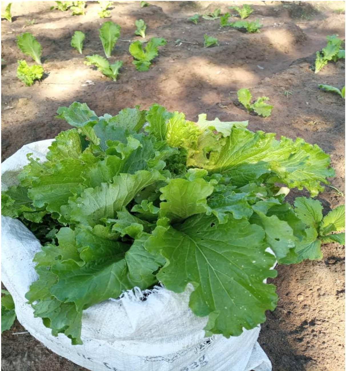
Photo showing garden

8; Agriculture and Gardening: Our Bibi shamba continues to teach girls on how to water vegetables and plant sweet potatoes.