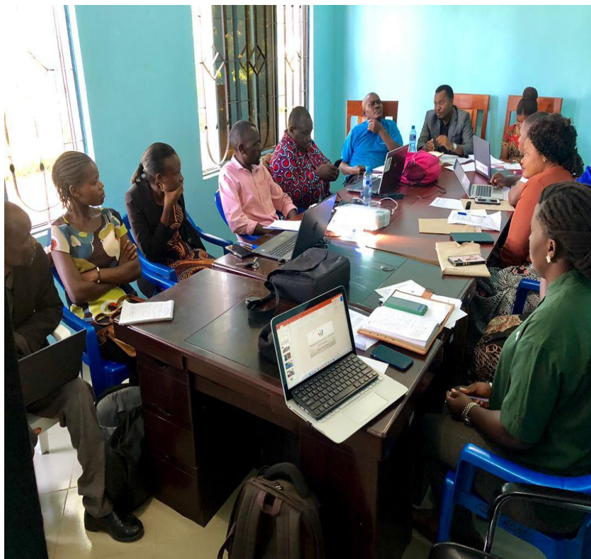
Stakeholders NaCongo meeting in Serengeti .