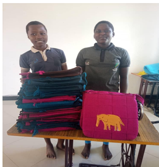
Photo showing girls in the tailoring class and Women handbags