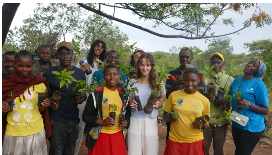
Photo showing girls, staff from HGWT, Serengeti District council and 3 students from France planting trees at HGWT land

Hope for Girls and Women Tanzania received 3 students from France conducting their research on Agroforest and Gender in Serengeti and Butiama. HGWT and Serengeti Agroforest Department collaborated to support 3 students to achieve their objectives.