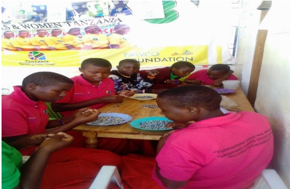
Photo showing girls making bracelets.

Making practical bracelets by using beads with different colours people like to wear. 35 students have understood well how to make BRACELET