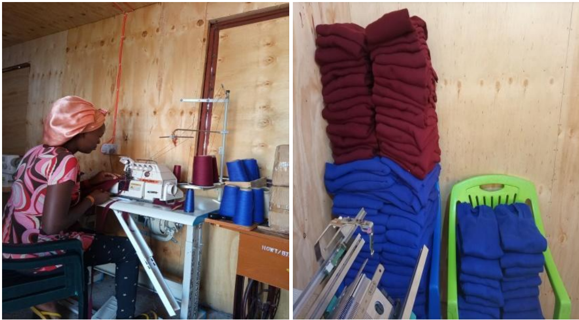
Photo taken showing Kulwa practising working with knitting machines.

Two girls continue to work on this project. Total of 50 sweaters were made in May.