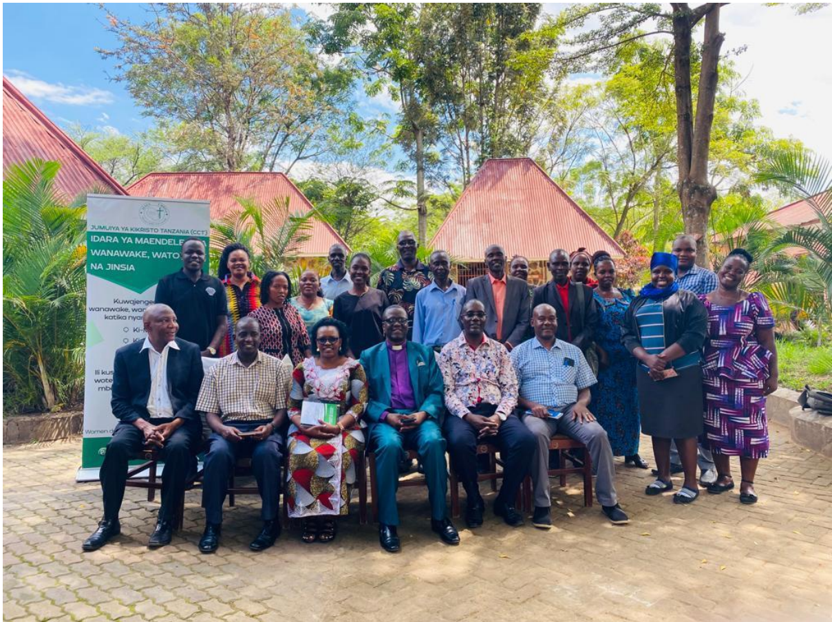
District commissioner with other stakeholders.

Hope for Girls and women Tanzania participated in a collaborative meeting conducted on finding a proper way of approaching FGM issue due to community changing way of practicing FGM and starting to practicing to young girls our success and challenges. Total of 35 people participated.