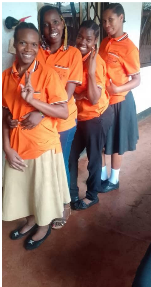
Photo showing girls supported by HGWT at More Than Drop centre in Moshi.

Supporting girls in education: HGWT continues to support Primary, secondary day girls and VTC with educational materials and tailoring materials. Entrepreneurship training conducted.