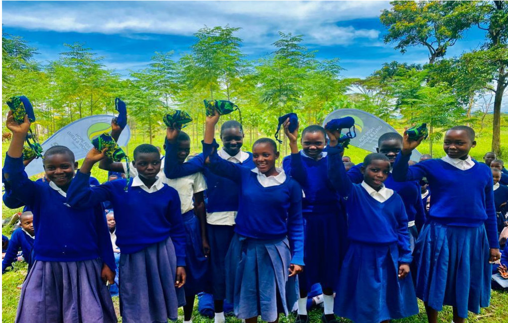
Photo showing girls received pads at

Hope for Girls and Women Tanzania distributed reusable pads to vulnerable girls, a total of 90 girls received pads. In Serengeti – Nyamoko primary, Kambarage and Nyamoko secondary. In Butiama – Nyamisisi primary and Kiabakari secondary.