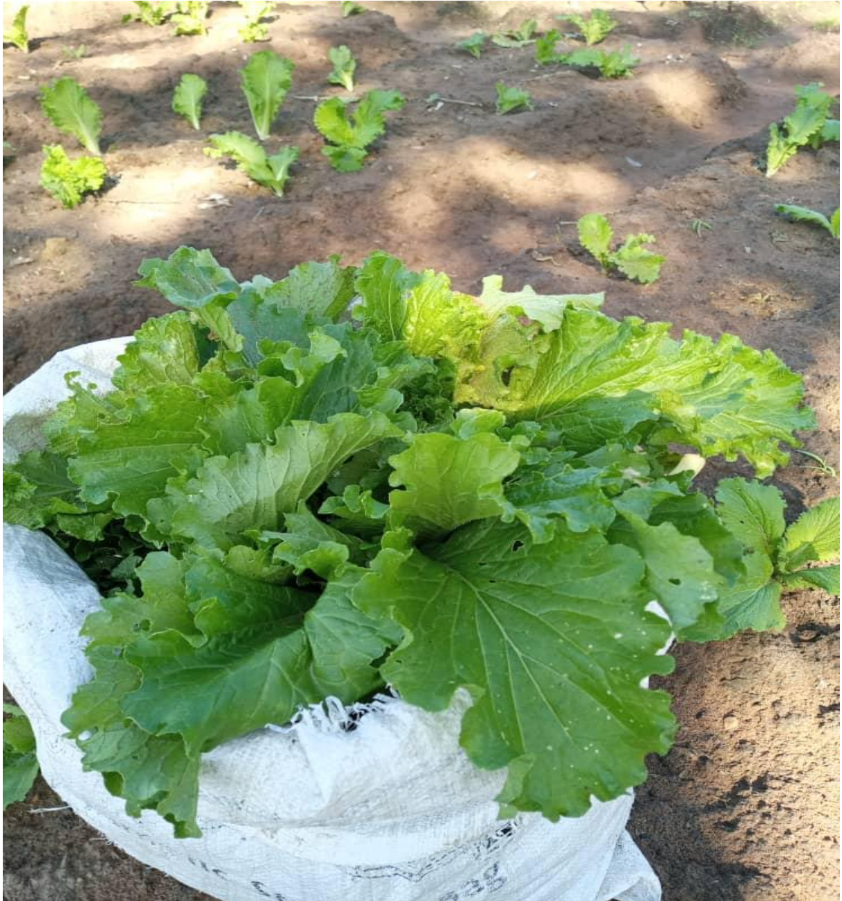
Photo showing garden