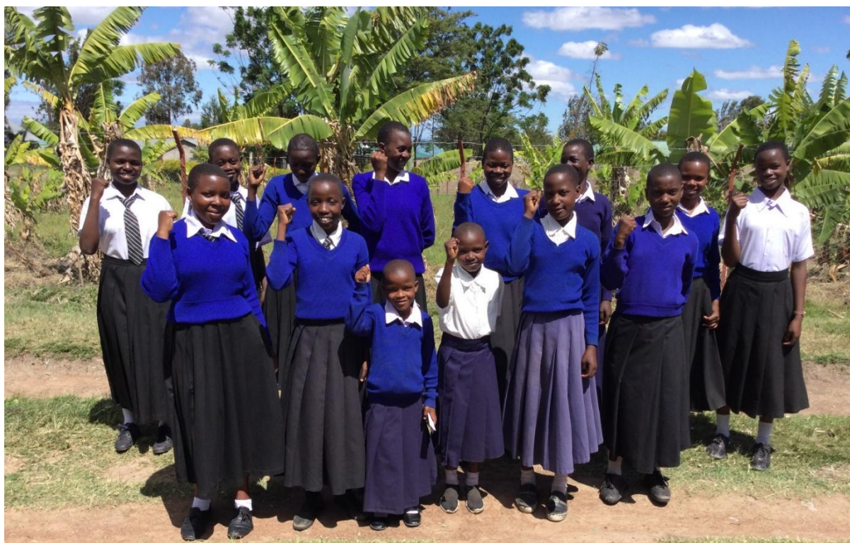
Photo showing primary school