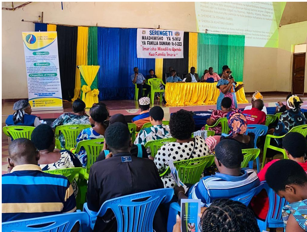
Photo taken during a family forum.

Hope for Girls and Women Tanzania in collaboration with Serengeti District council organised a family day forum which involved parents, children, Religious leaders, community leaders and traditional leaders. The topic was How parents could contribute to good behaviour to their children and prevent violence to children. Total of 50 people participated.