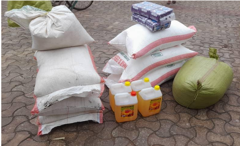
Support of food we receive from Four seasons Item that we receive from Four session