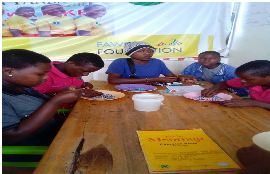
Photo showing girls making bracelets.

Practical making Bracelets by using beads were people like to wear with different colour, 10 students have understood well how to make a BRACELET