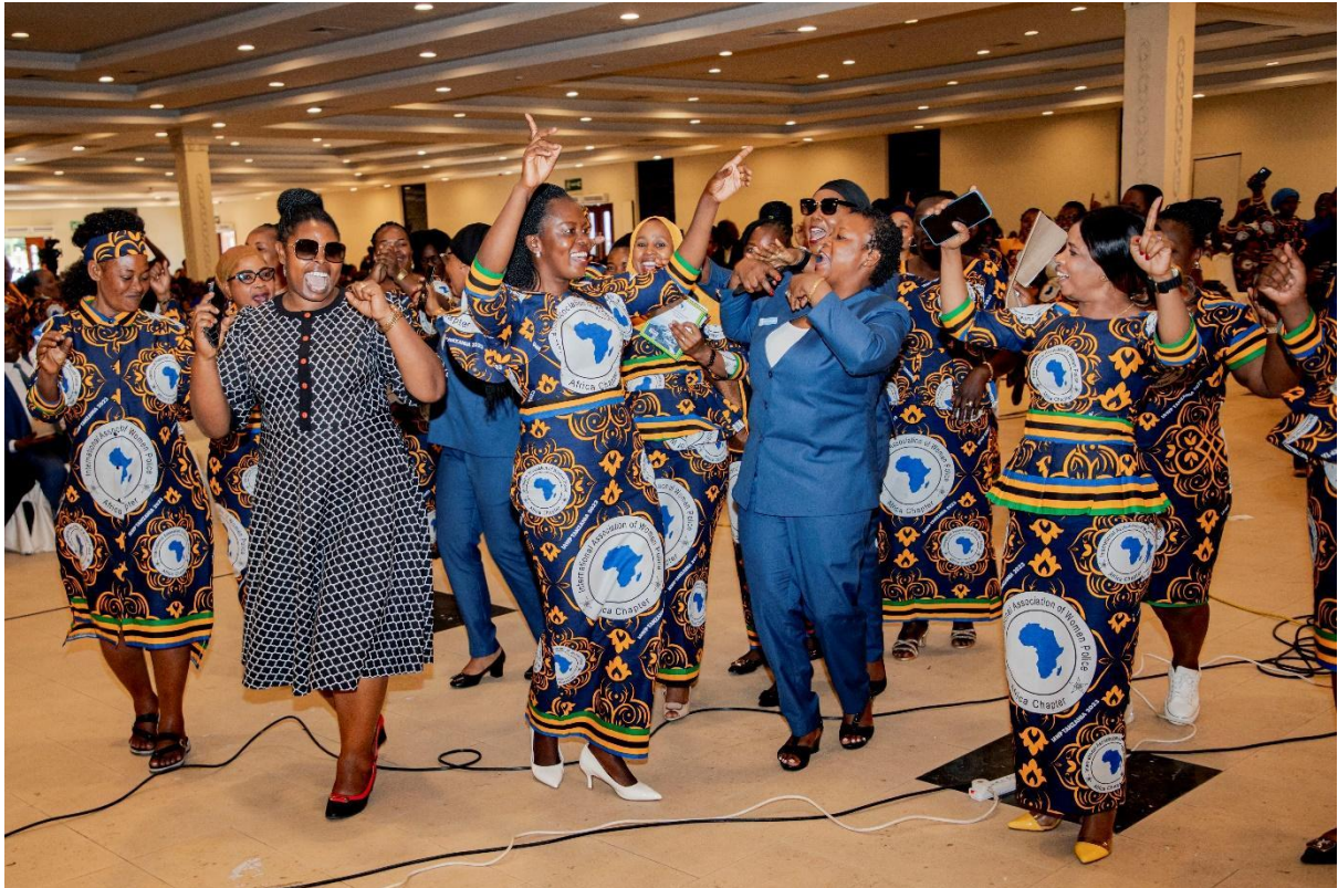
Photo taken after presentation congratulating HGWT and Sijali on her work for FGM cases.