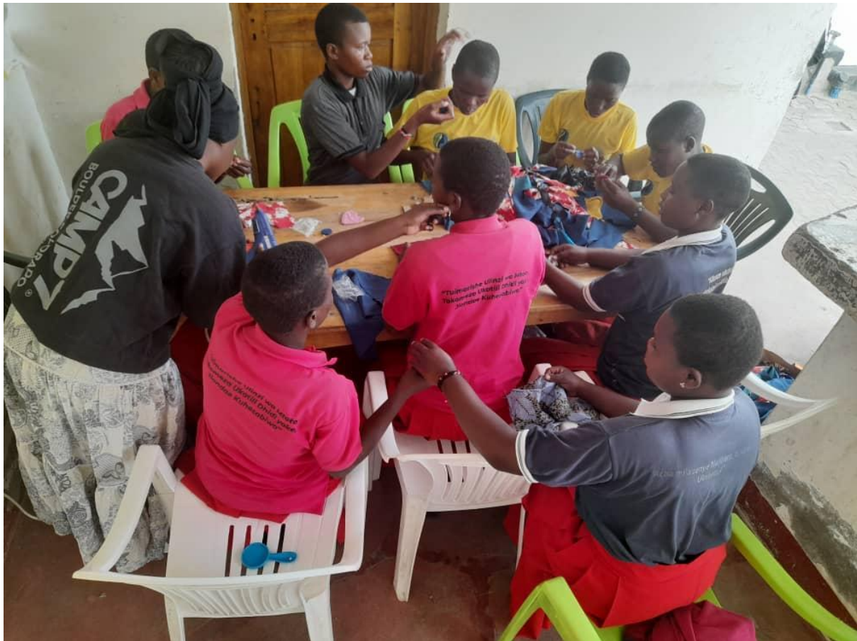
Photo showing girls learning to make hearings