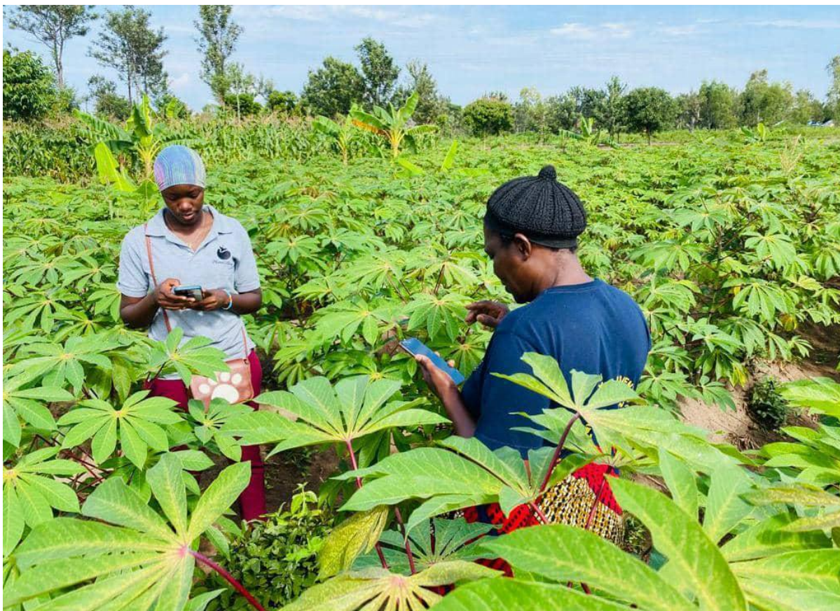
Photo showing farmers using their smartphones scanning their plants

10: Visiting the farmers. The agricultural officer visited the farmer's groups in Butiama and Serengeti and advised them on their challenges concerning their farming work.