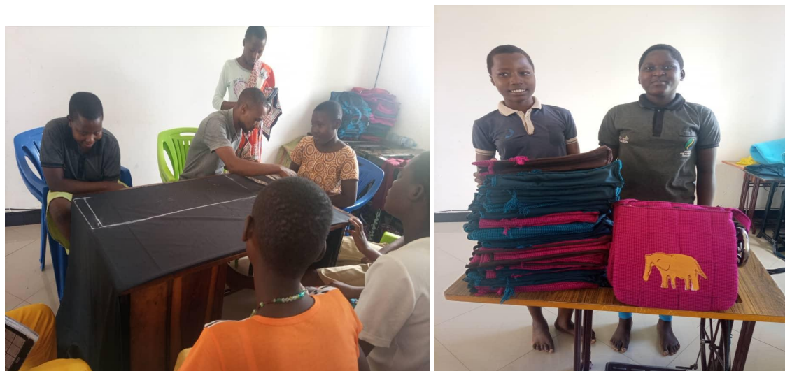
Photo showing girls in the tailoring class and Women handbags

Supporting girls in education: HGWT continues to support Primary, secondary day girls and VTC with educational materials and tailoring materials. Entrepreneurship training conducted.