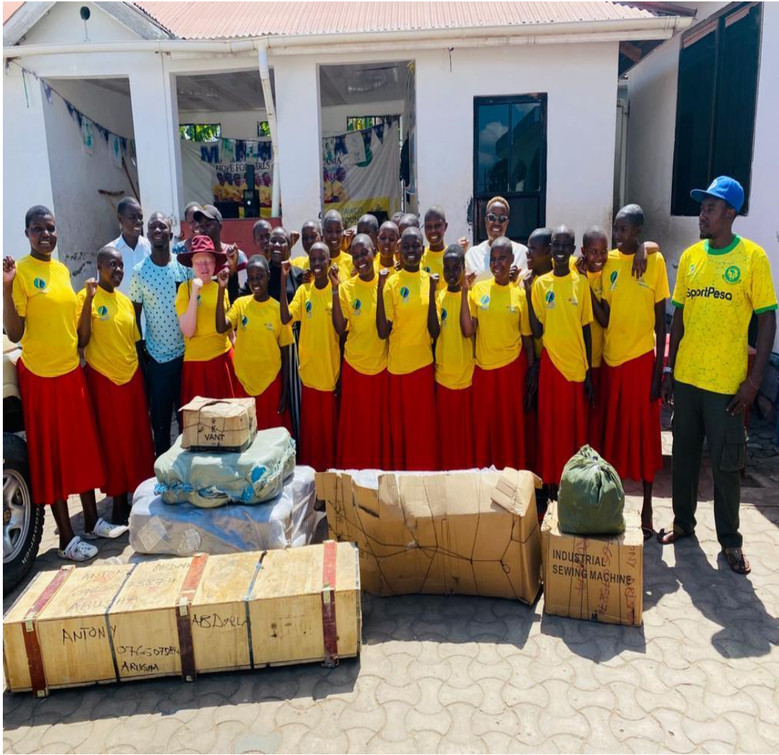
Photo showing a Knitting machine supported to Mugumu Safe house by Fourseasons