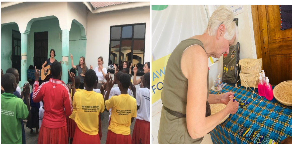
Photo showing visitors and girls saying goodbye to each other