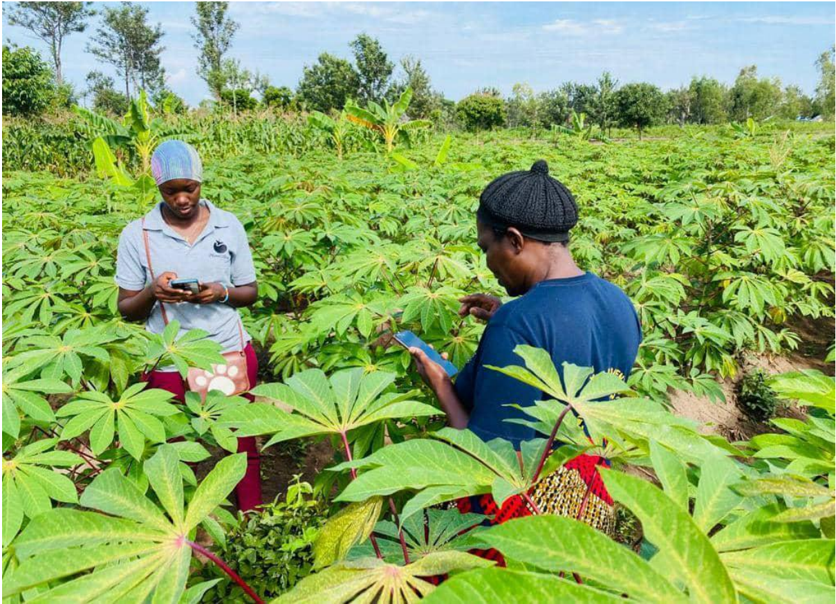
Photo showing famers using their smart phones scanning their plants

I0: Visiting the farmers. The agricultural officer visited the farmer's groups in Butiama and advised them on their challenges concerning their farming work.