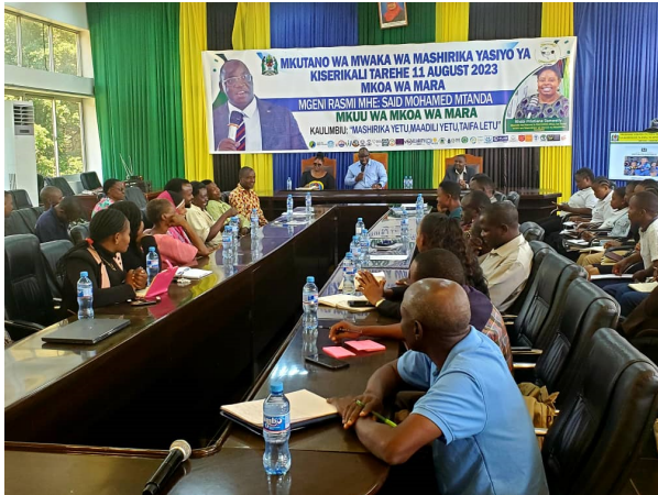
Photo taken during Annual NGOs meeting for Mara.