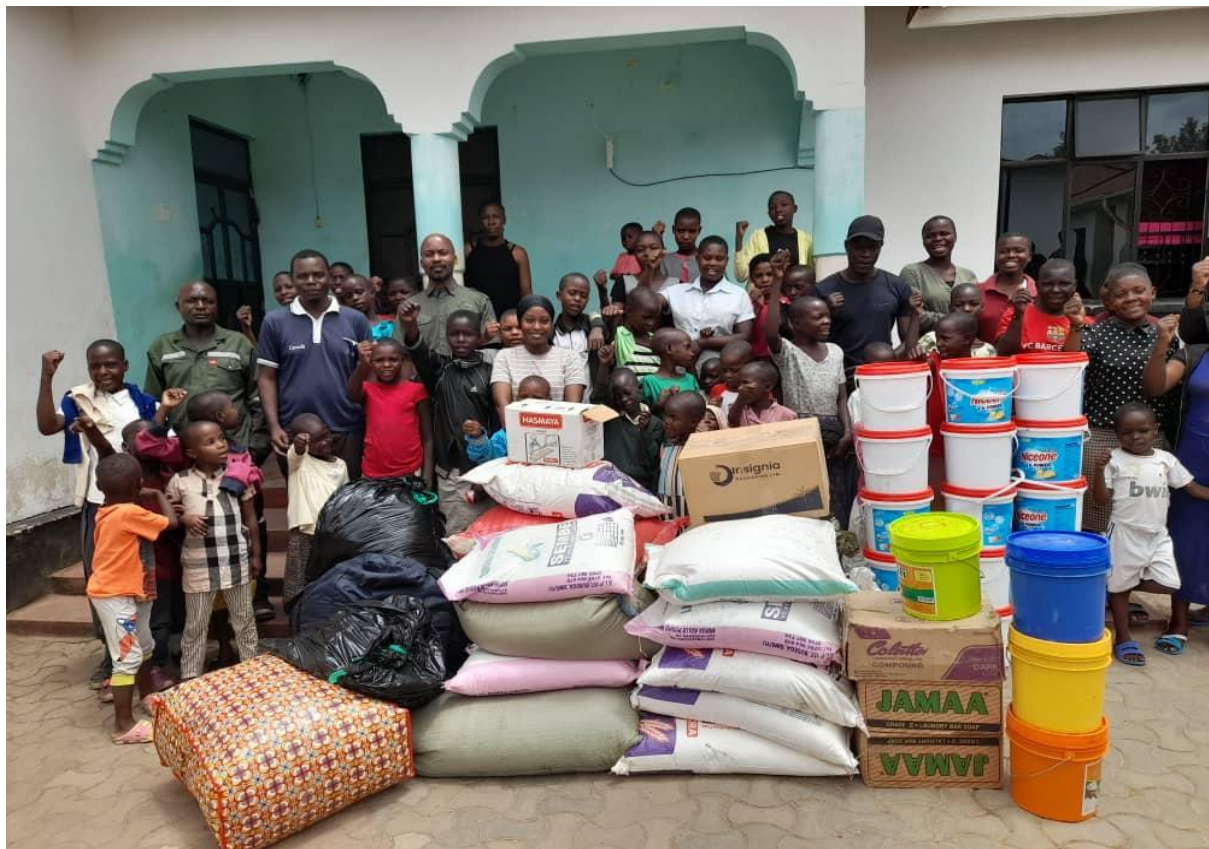
Photo showing children and items received at Mugumu Safe House.

Special thanks to Grumeti for their kind support of food, basic needs, hygienic items, clothes and gas.