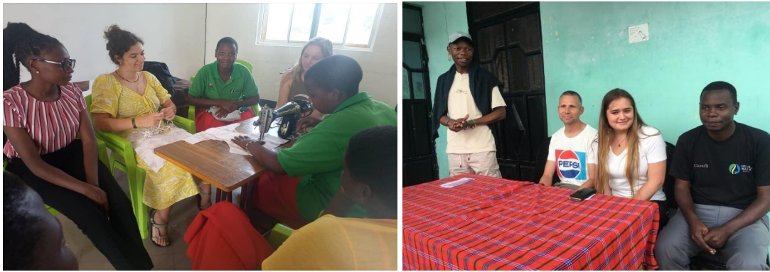
Photo showing visitors whom visited the safe houses in August