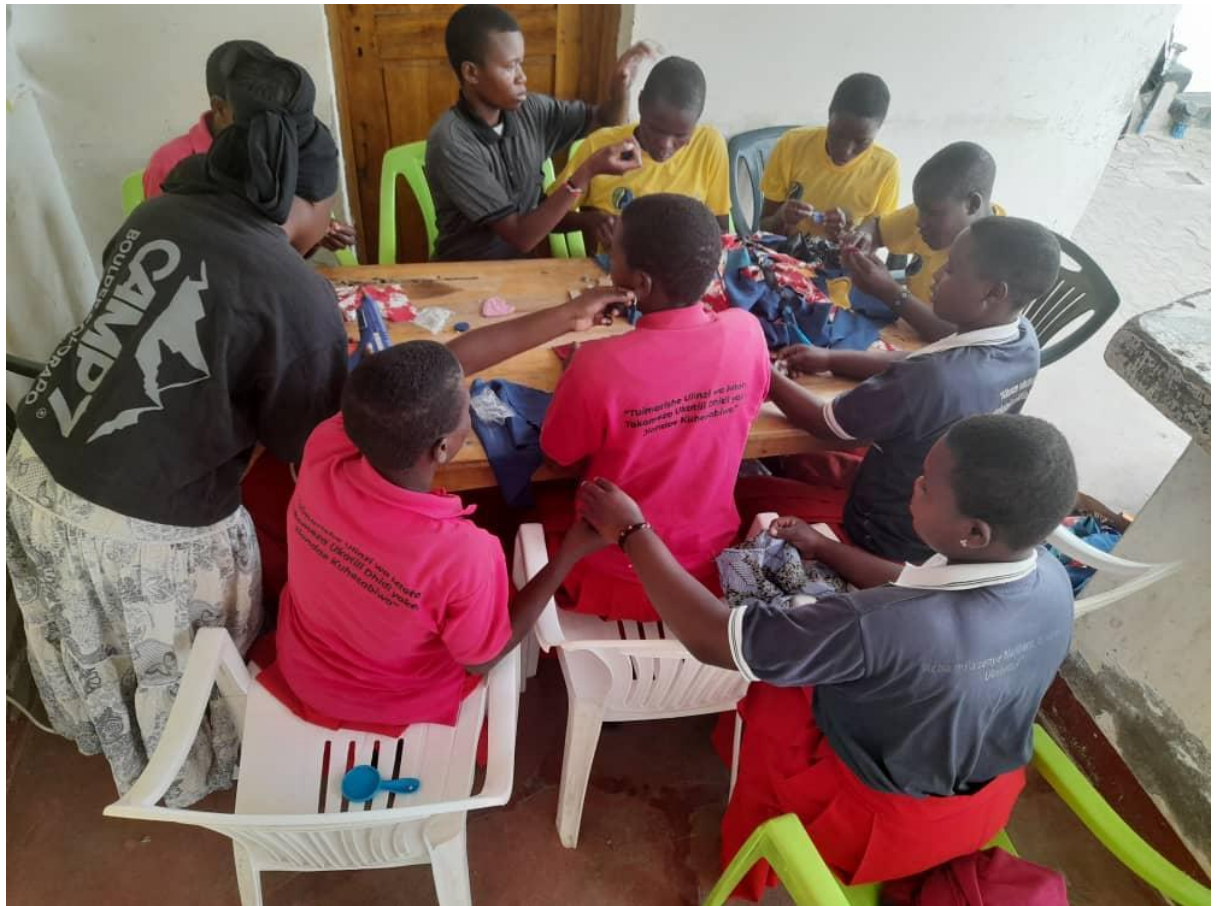
Photo showing girls learning to make hearings