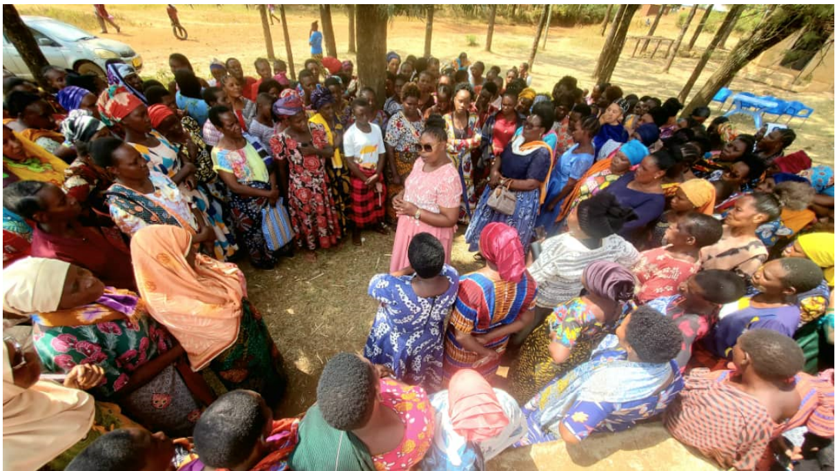
Photo showing women attending roadshow at Kiabakari villages.

Hope for Girls and Women Tanzania organized a roadshow at Kiabakari village, more than 150 people attended. Ant FGM and GBV messages were delivered.