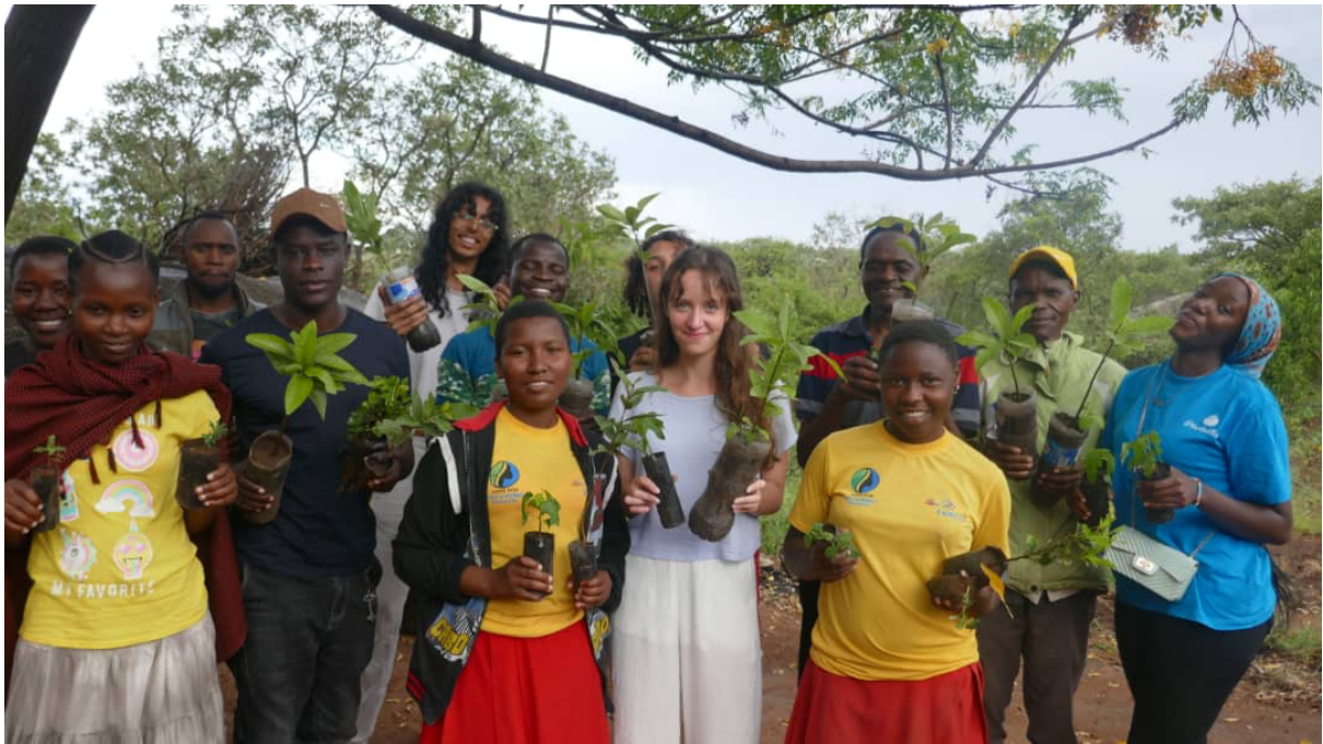
Photo showing girls, staff from HGWT, Serengeti District council and 3 students from France planting trees t HGWT land

HGWT and Serengeti Agroforest Department collaborated to support 3 students to achieve their objectives. HGWT planted trees for fruits and timber at Matare land. Trees and fruits are continuing well.