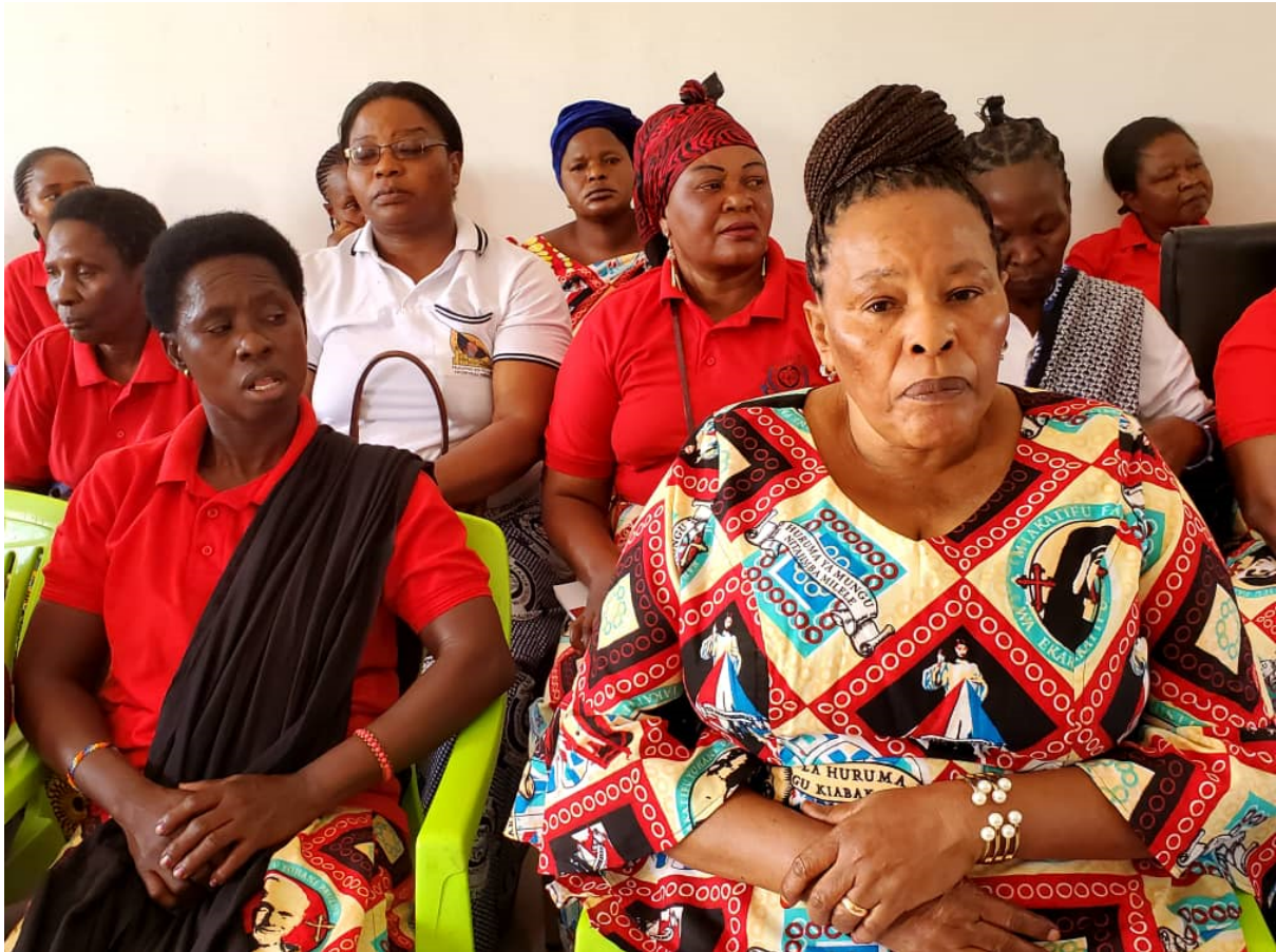
Photo showing Roman Catholic women during their visit at Butiama Safe house.