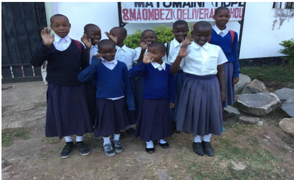
Photo showing girls schooling at primary in Mugumu safe house.

Supporting girls in education: HGWT continue to support Primary, secondary day girls and VTC with educational materials and tailoring materials. Entrepreneurship training conducted.