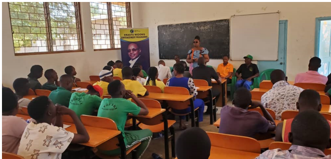
Photo showing women in the forum