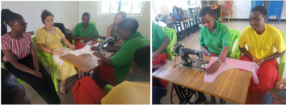
Photo showing girls at vocational learning how to make pumpers.

8; Agriculture and Gardening: Our Bibi shamba continues to teach girls on how to water vegetables and plant sweet potatoes.