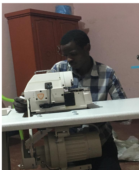
Photo showing a Knitting machine supported to Mugumu Safe house by Fourseasons installed and overlock machines.