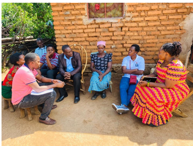
Photos taken during reconciliation

2: Reconciliation work: Hope for Girls and Women in Tanzania staff in collaboration with Social welfare from Serengeti and Butiama District office, Police Gender desk officers and Community Development officers managed to conduct the reconciliation session meetings between parents and their daughters in various villages in Serengeti, Butiama, Rorya and Tarime. Total of 26 girls were reconciled and joined their families. The cutting situation in the remote villages is very bad because the cutting is continuing secretly any time to girls, this is why the high number of girls protected to the safe houses is for their safety. Total of 157 girls staying to the safe houses.