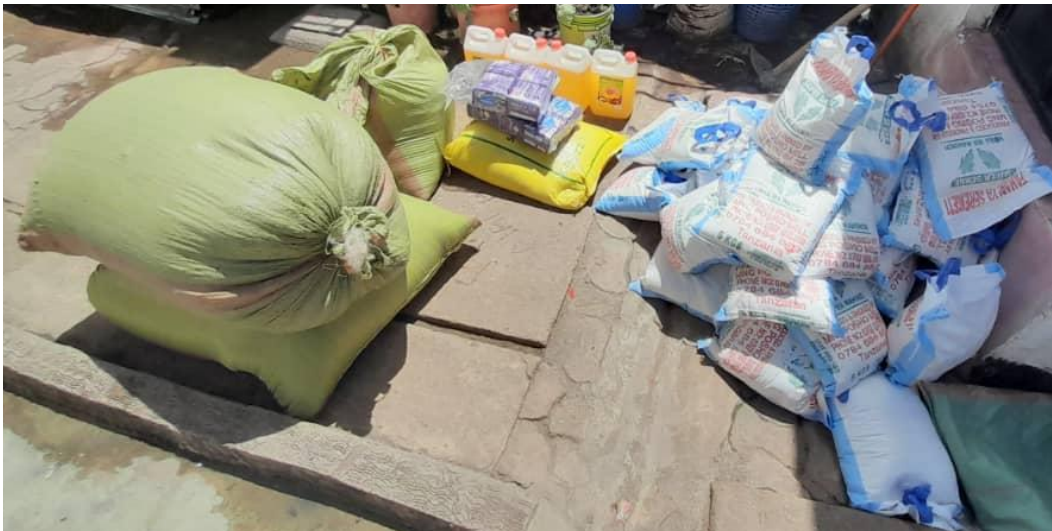
Support of food we receive from Four season.

Mugumu safe house received valuable support from Fourseasons, Thank you very much.