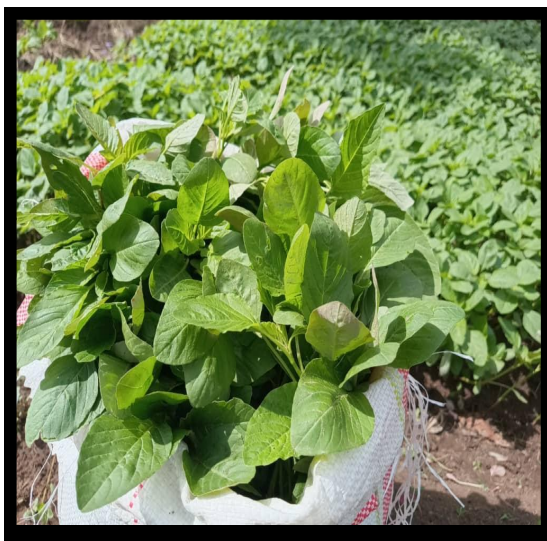
Photo showing vegetable at our garden in Mugumu garden.

9: Visiting the farmers. We collaborated with the extension agricultural officer to visit the farmer's community leaders at Kinyariri and Kukirango. During the visit the extension officer they manage to provide technical backstopping by training the famers on how to join the group in their mobile phones. The extension Officer reminded the farmers on how to use PlantNuru app. Also, during the visit he had the opportunity to