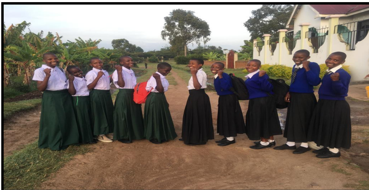
Our girls who are in primary and some in secondary school enjoy going to school their future is bright at safe house.