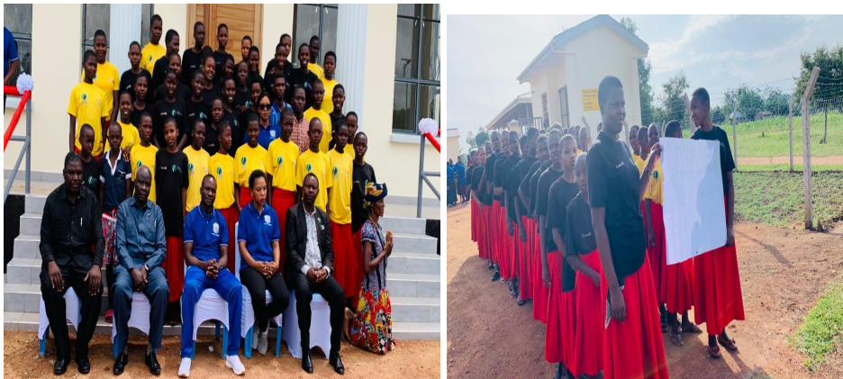
Photo taken during law week event at Butiama .

6. Law Week: Butiama and Mugumu Safe Houses participated in the Law week, where The Guests of Honor addressed FGM practices as violation of Human Rights and a violence to girls and women. Law week was used to raise awareness to the community to obey laws and stop violence to children, girls and women.