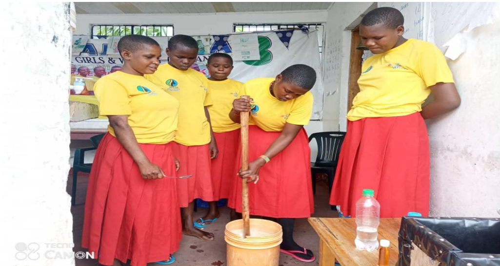
Girls in practical training of making soap